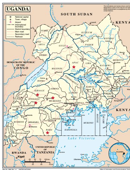
Figure 1: Map of Uganda with stars indicating the five districts where ultra-portable X-ray and CAD systems have been deployed

In line with this national strategy, the Stop TB Partnership, in collaboration with the United States Agency for International Development (USAID), provided five Delft light ultra-portable X-ray systems with CAD4TB software through the introducing New Tools Project (iNTP) to the Uganda National Tuberculosis and Leprosy Programme (NTP). This adds to the existing seven digital X-ray systems with CAD in the country, and fits into strategies to close the detection gap through the use of innovative tools in Uganda. The NTP, together with the USAID Mission in Uganda and the USAID Local Partner Health Services - TB (USAID LPHS-TB), has been implementing the roll-out of these innovative tools in five health facilities. These health facilities, which did not previously have access to X-ray services, are in the following areas: Apac, Kagadi, Kyenjojo, Mityana and Rakai.