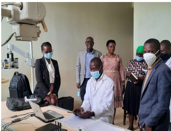
Support visit of the NTL Assistant Commissioner to Mityana for GeneXpert and CAD, accompanied by MJAP Executive Director and the staff of the connectivity project

Despite challenges faced by some facilities in attaining reliable data transfer through cellular networks, a connectivity uptime of 75% was achieved for GeneXperts. LabXpert has provided valuable information at both national and facility levels to encourage real-time reporting for GeneXpert and Truenat instruments, with a 71% real-time reporting rate achieved for GeneXpert instruments and 63% for Truenat instruments.