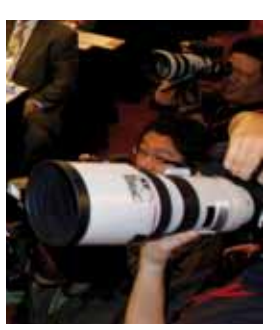
Participants of the ministerial meeting of high M/XDR-TB burden countries.