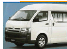
Toyata Haice Van